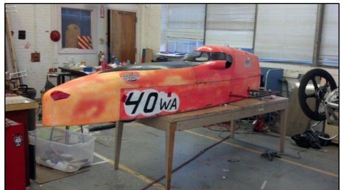
The newest addition to the Engineering Team's fleet of electric race cars.

One of the club's main focuses is the future, and Electrathon racing provides the perfect opportunity to design, construct, and trouble shoot an electric vehicle. Electrathon is a competition where teams design and build electric vehicles that will race for one hour at a time. The goal of this event is to travel the greatest distance over the one-hour period using only 65 pounds of commercial lead acid batteries. This makes teams analyze many aspects that are key to developing an electric car including algebra, business management, computer science, geometry, material science, physics, electricity, electronics, and chemistry.