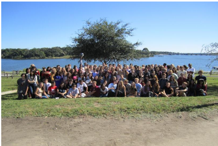
The I.B. Class of 2013

Boycott of the Century of the 1980 and the 1984 Olympics." Essays were collected and then sent to the International Baccalaureate Organization for assessment. The ceremony was followed by a senior service project at C.A. Weis Elementary and a picnic at Bayview Park, both sponsored by IBSF.